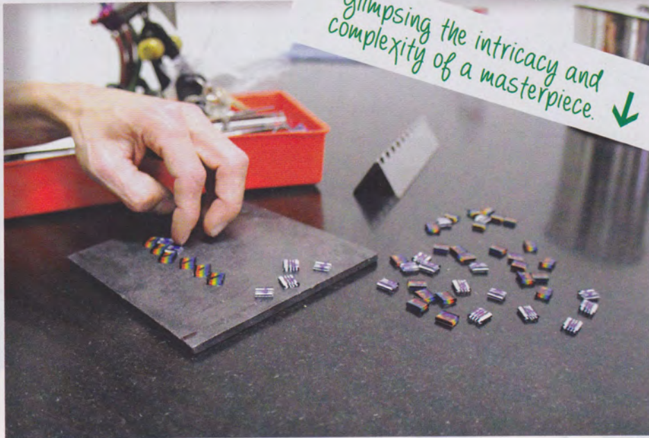
Glimpsing the intricacy and complexity of a masterpiece. ↓