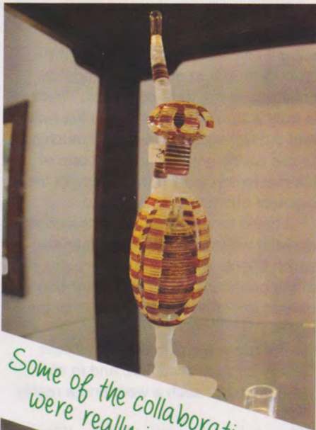
Some of the collaborations were really inspiring.