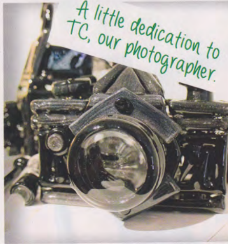
A little dedication to TC, our photographer.