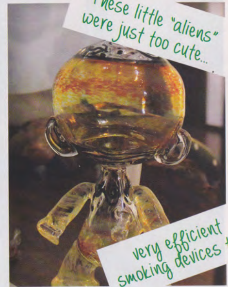
These little "aliens" were just too cute...