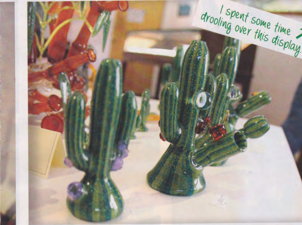
I spent some time drooling over this display.