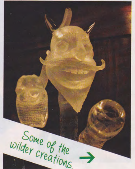
Some of the wilder creations. →